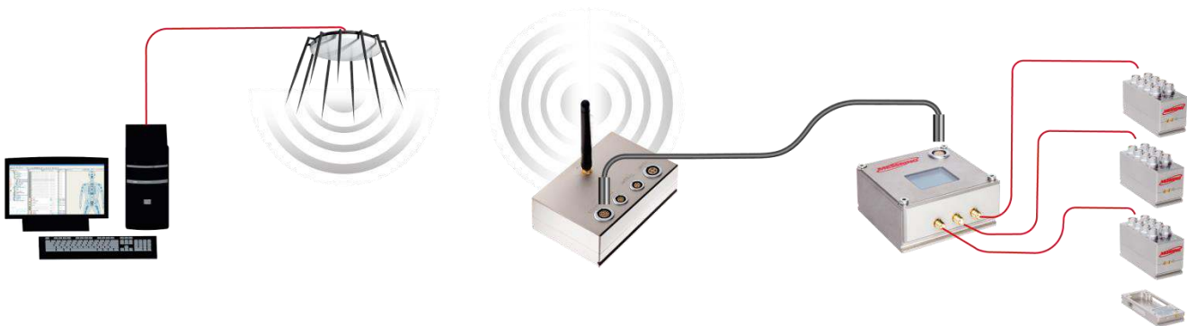
Figure 1: Example system setup