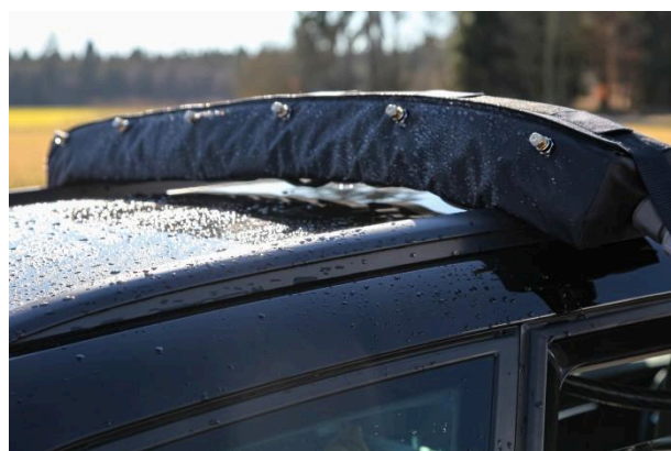
Close-up of the mounted SprayMaker © MESSRING GmbH

Images and video are free for editorial use by adding credit © MESSRING GmbH