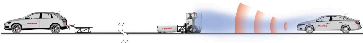
Illustration: Test with train target (EVT or SSV) with rain simulation until collision occurrence