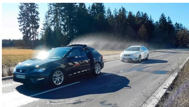
Test drive with activated SprayMaker