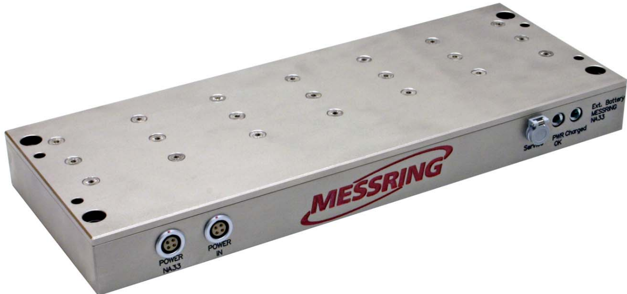
Figure 1: Shockproof external battery